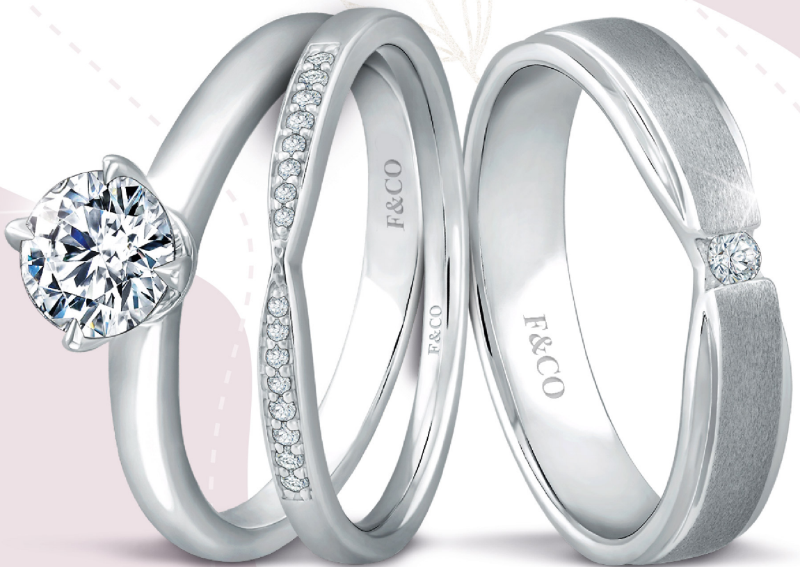
FMWT150009 Wedding Ring FWPT160272 Engagement Ring

The Residence of F Colour and VVS Clarity Diamond Jewellery